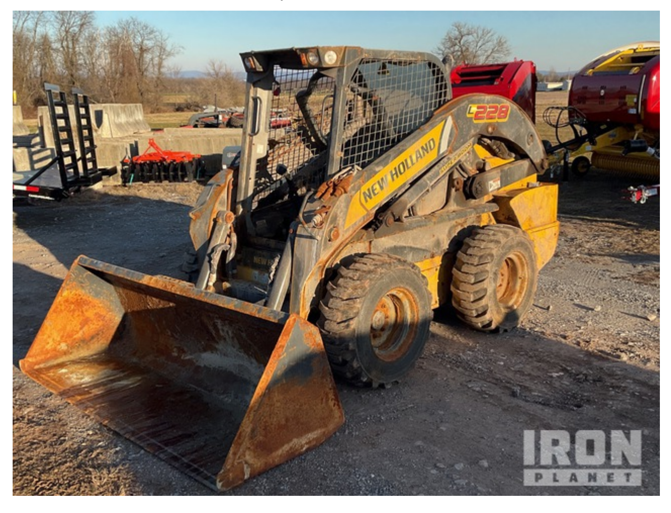
(82 - photos & videos)

LOCATION Abbottstown, Pennsylvania, United States, 17301