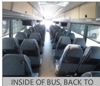
INSIDE OF BUS, BACK TO FRONT