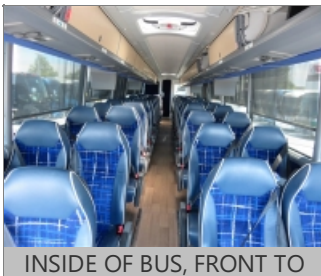
INSIDE OF BUS, FRONT TO BACK