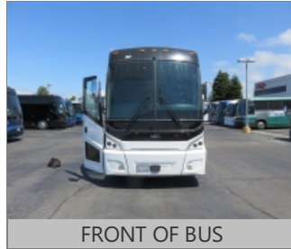
FRONT OF BUS