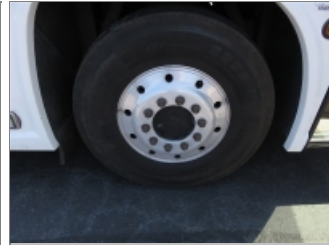
LEFT STEER TIRE