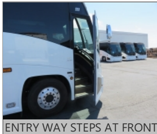
ENTRY WAY STEPS AT FRONT DOOR