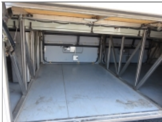
INSIDE STORAGE COMPARTMENTS