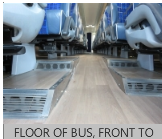
FLOOR OF BUS, FRONT TO BACK