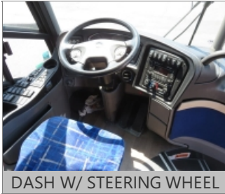
DASH W/ STEERING WHEEL