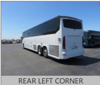
REAR LEFT CORNER