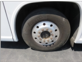
RIGHT STEER TIRE