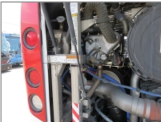
ENGINE COMPARTMENT LEFT SIDE