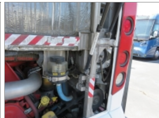
ENGINE COMPARTMENT RIGHT SIDE