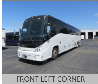
FRONT LEFT CORNER