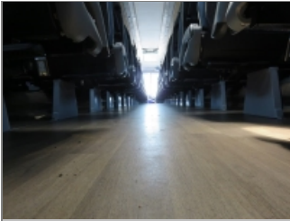
FLOOR OF BUS, BACK TO FRONT