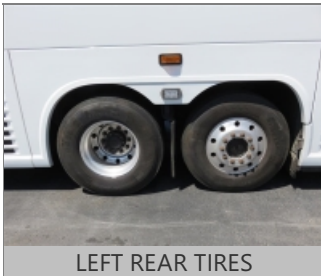
LEFT REAR TIRES