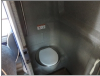
INSIDE RESTROOM #1