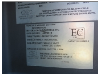
ENGINE FAMILY NUMBER