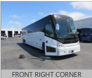
FRONT RIGHT CORNER