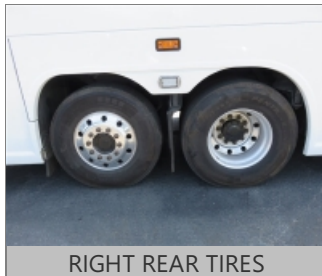
RIGHT REAR TIRES