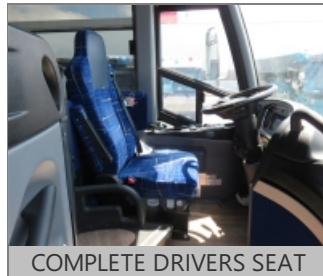
COMPLETE DRIVERS SEAT