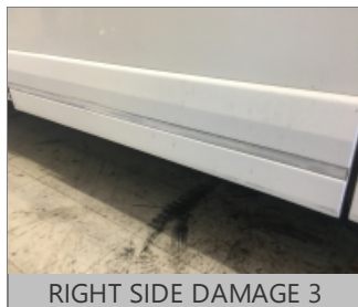
RIGHT SIDE DAMAGE 3