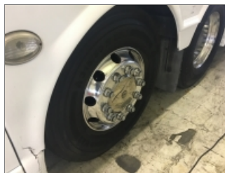
RIGHT REAR TIRE