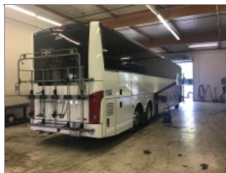
RIGHT SIDE REAR