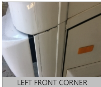
LEFT FRONT CORNER DAMAGE