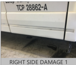
RIGHT SIDE DAMAGE 1