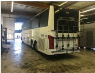
LEFT SIDE REAR