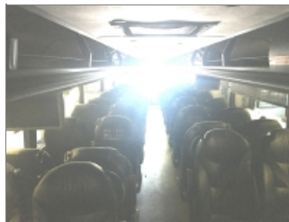
INTERIOR REAR TO FRONT