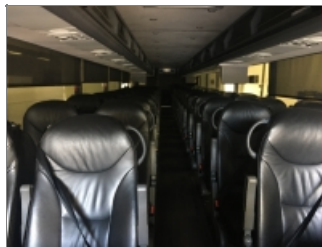
INTERIOR FRONT TO REAR