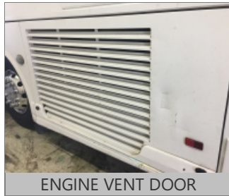
ENGINE VENT DOOR