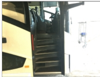
ENTRY DOOR AREA