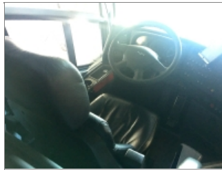
DASH W/ STEERING WHEEL