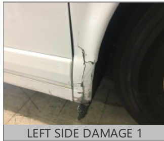
LEFT SIDE DAMAGE 1