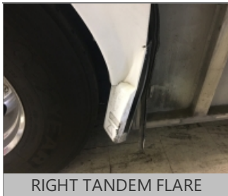
RIGHT TANDEM FLARE DAMAGE