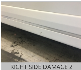
RIGHT SIDE DAMAGE 2