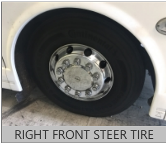
RIGHT FRONT STEER TIRE