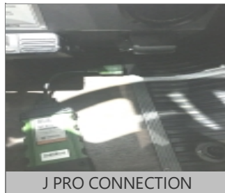
J PRO CONNECTION