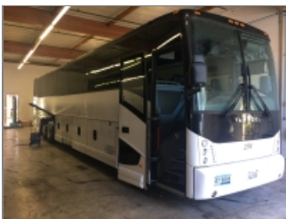
RIGHT SIDE FRONT