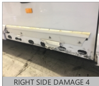
RIGHT SIDE DAMAGE 4