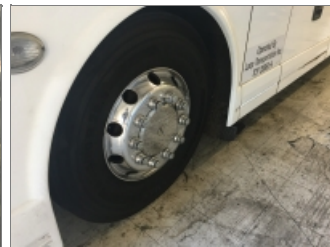
LEFT STEER TIRE