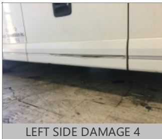
LEFT SIDE DAMAGE 4