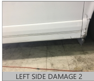
LEFT SIDE DAMAGE 2