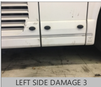
LEFT SIDE DAMAGE 3