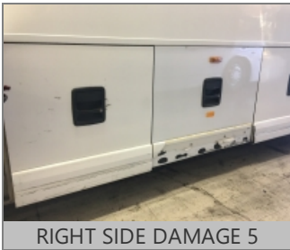
RIGHT SIDE DAMAGE 5