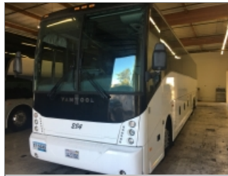
LEFT SIDE FRONT