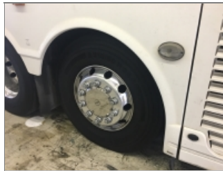
LEFT REAR TIRE