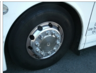
LEFT STEER TIRE