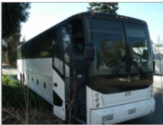
RIGHT SIDE FRONT