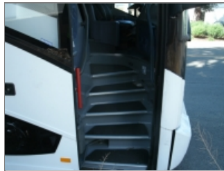
ENTRY DOOR AREA