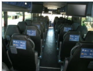
INTERIOR REAR TO FRONT