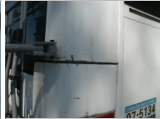
RIGHT REAR CORNER DAMAGE