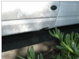
RIGHT CARGO DOOR LOWER MLDG DA