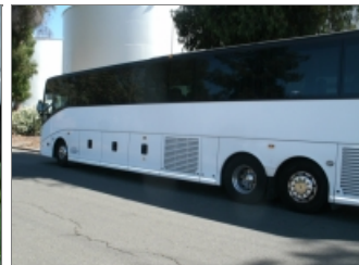
LEFT SIDE BUS