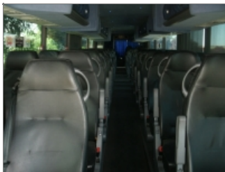
INTERIOR FRONT TO REAR