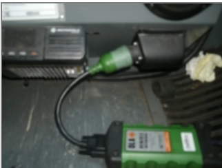
J PRO CONNECTION PROBLEM