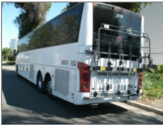
LEFT SIDE REAR