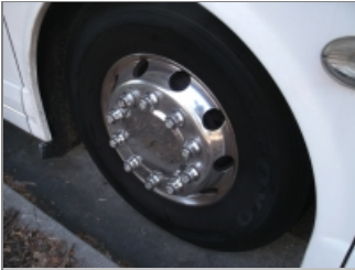
RIGHT FRONT STEER TIRE

INSP DATE | VIN (LAST 8) | PO NUMBER 08/07/2020 | F3048544