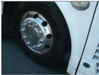
LEFT REAR TIRE