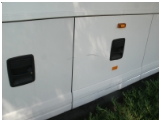
RIGHT SIDE CARGO DOOR DAMAGE