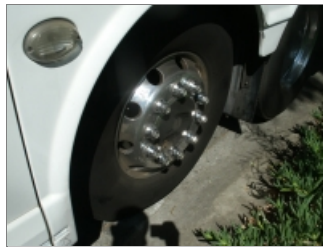
RIGHT REAR TIRE