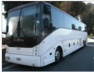
LEFT SIDE FRONT