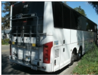
RIGHT SIDE REAR