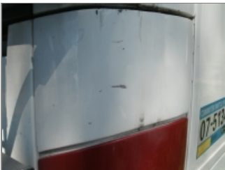
RIGHT LOWER REAR DAMAGE