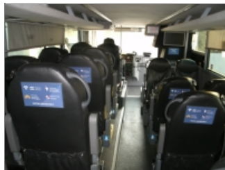
INTERIOR REAR TO FRONT