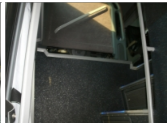
STAIRS TO UPPER SEATS