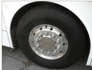
RIGHT FRONT STEER TIRE