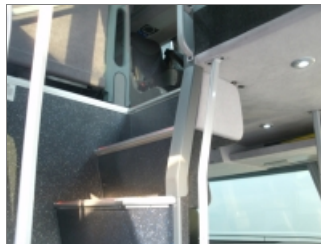
STAIRS TO UPPER SEATS