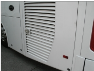
ENGINE VENT DOOR