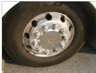
RIGHT REAR TIRE