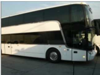
RIGHT SIDE FRONT