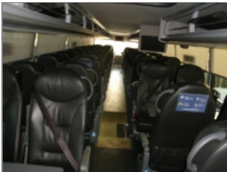
UPPER INTERIOR REAR TO FRONT