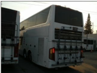
LEFT SIDE REAR