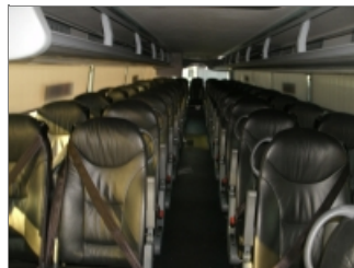
UPPER INTERIOR FRONT TO REAR