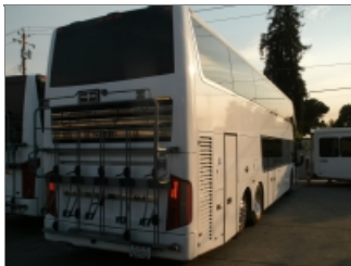
RIGHT SIDE REAR