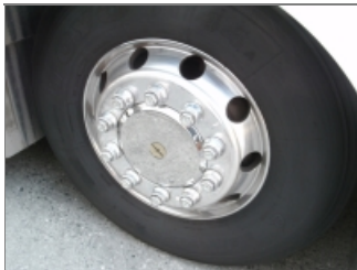
LEFT REAR TIRE