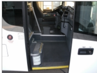
ENTRY DOOR AREA