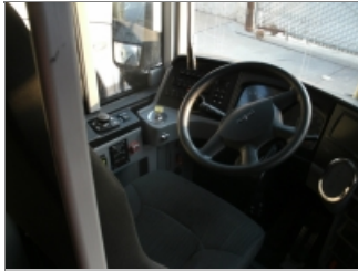
DASH W/ STEERING WHEEL