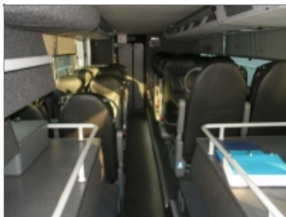
INTERIOR FRONT TO REAR