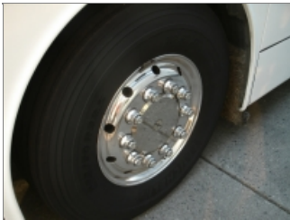
LEFT STEER TIRE