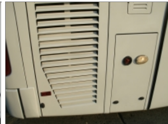
ENGINE VENT DOOR