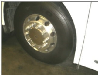
LEFT REAR TIRE