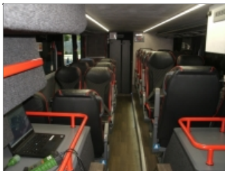
INTERIOR FRONT TO REAR