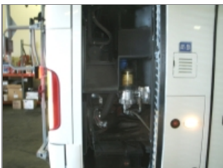
ENGINE COMPARTMENT RIGHT SIDE