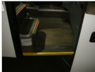
ENTRY DOOR AREA