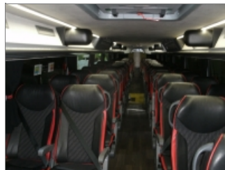
UPPER FLOOR INTERIOR FRONT TO