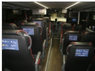
INTERIOR REAR TO FRONT