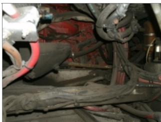
ENGINE COMPARTMENT LEFT SIDE