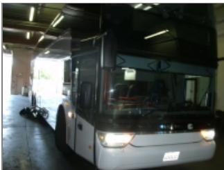
RIGHT SIDE FRONT