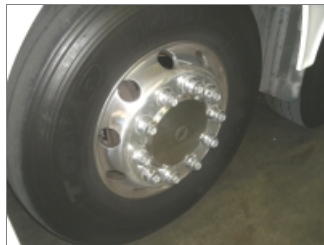
RIGHT REAR TIRE