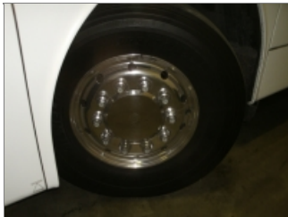
LEFT STEER TIRE