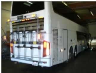
RIGHT SIDE REAR