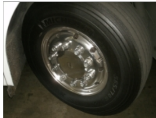
RIGHT FRONT STEER TIRE