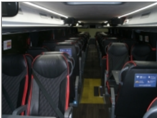
UPPER FLOOR INTERIOR REAR TO F