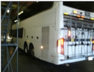
LEFT SIDE REAR