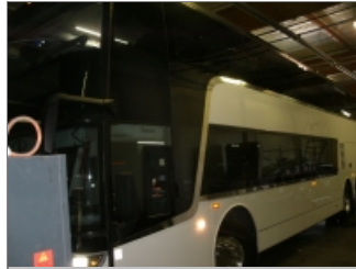
LEFT SIDE FRONT