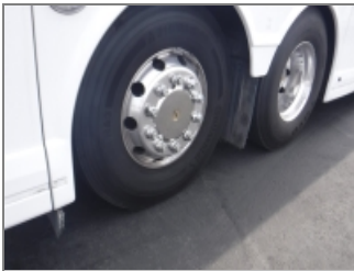
RIGHT REAR TIRES