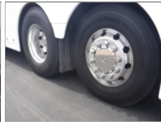
LEFT REAR TIRES