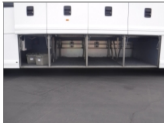
INSIDE STORAGE COMPARTMENTS