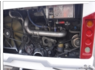
ENGINE COMPARTMENT RIGHT SIDE