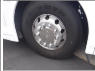
LEFT STEER TIRE