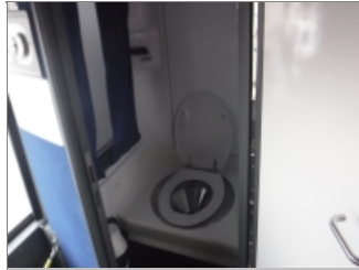
INSIDE RESTROOM #1