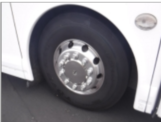
RIGHT STEER TIRE