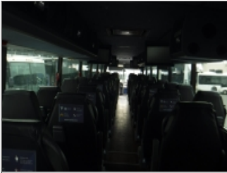
INSIDE OF BUS, BACK TO FRONT