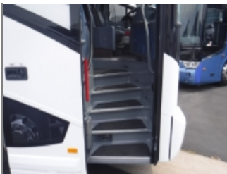
ENTRY WAY STEPS AT FRONT DOOR