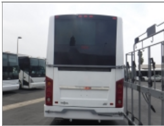
REAR OF BUS