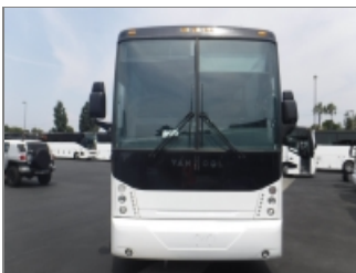
FRONT OF BUS