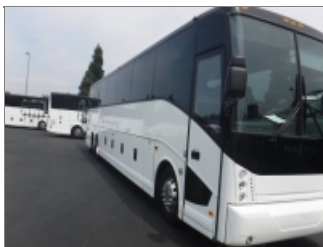
FRONT RIGHT CORNER