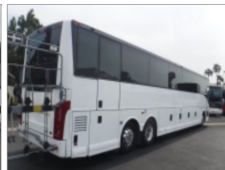
REAR RIGHT CORNER