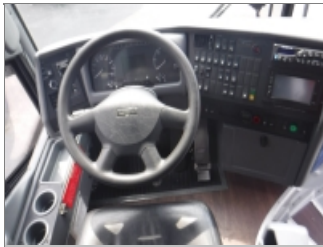
DASH W/ STEERING WHEEL