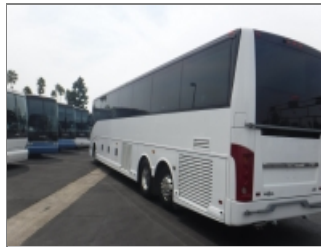
REAR LEFT CORNER