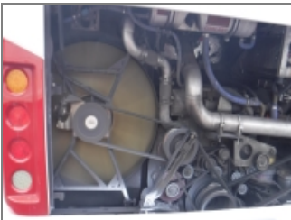
ENGINE COMPARTMENT LEFT SIDE