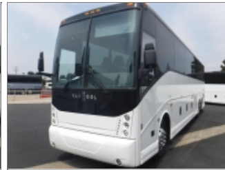
FRONT LEFT CORNER