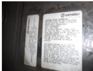
ENGINE FAMILY NUMBER