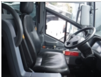
COMPLETE DRIVERS SEAT