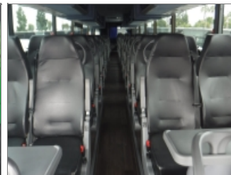
INSIDE OF BUS, FRONT TO BACK