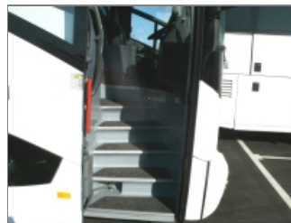
ENTRY DOOR AREA