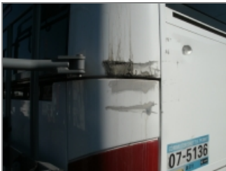
RIGHT REAR CORNER DAMAGE