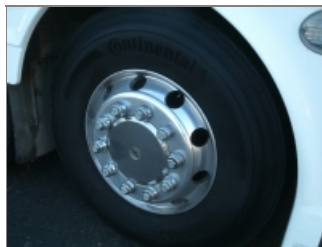
LEFT REAR TIRE