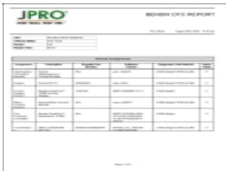
J PRO 1