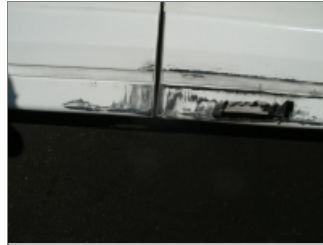
RIGHT SIDE DAMAGE 2