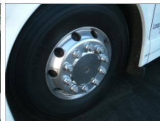
LEFT STEER TIRE