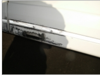
RIGHT SIDE DAMAGE 1