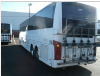
LEFT SIDE REAR