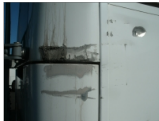
RIGHT UPPER CORNER DAMAGE