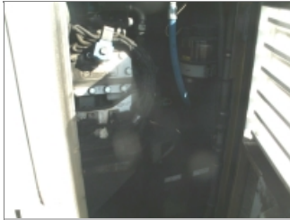
ENGINE RIGHT SIDE