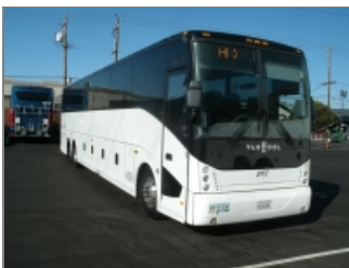
RIGHT SIDE FRONT