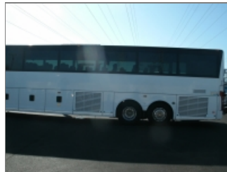
LEFT SIDE BUS