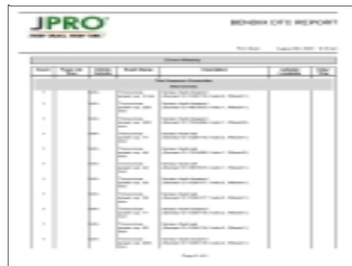
J PRO 3