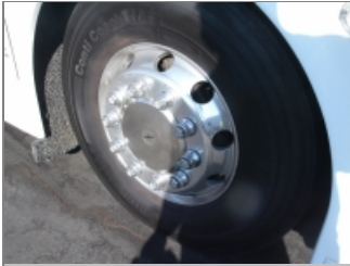
RIGHT FRONT STEER TIRE