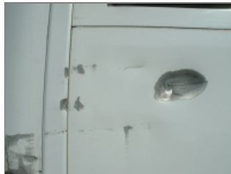
RIGHT REAR CORNER DAMAGE