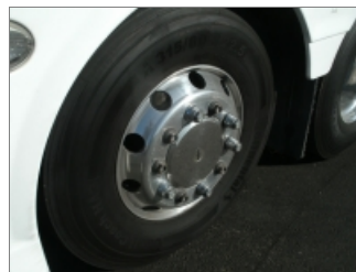
RIGHT REAR TIRE