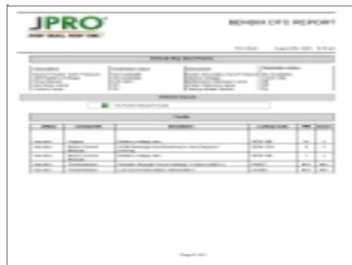
J PRO 2