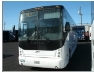
LEFT SIDE FRONT