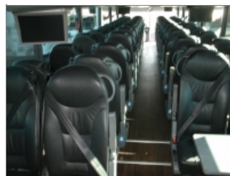
INTERIOR REAR TO FRONT