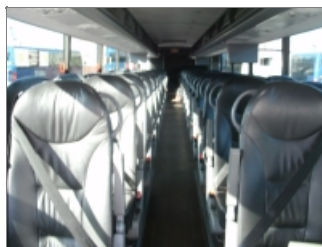
INTERIOR FRONT TO REAR