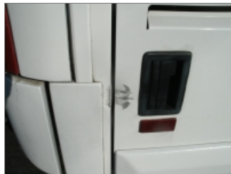
RIGHT ENGINE DOOR & CORNER DAM