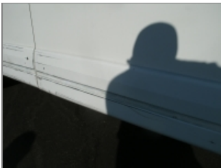
RIGHT SIDE DAMAGE 3