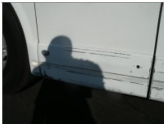
RIGHT SIDE DAMAGE 4