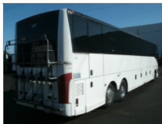
RIGHT SIDE REAR