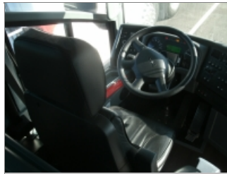
DASH W/ STEERING WHEEL