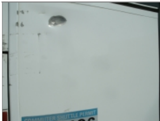
ENGINE DOOR DAMAGE