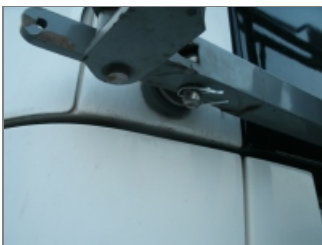
BIKE RACK PIN