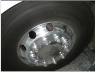
RIGHT FRONT STEER TIRE