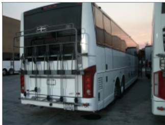
RIGHT SIDE REAR