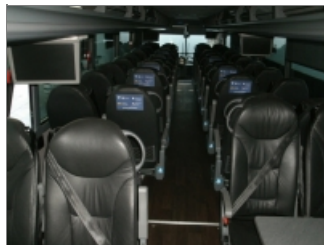
INTERIOR REAR TO FRONT