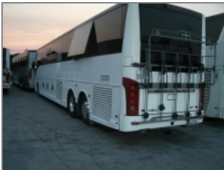
LEFT SIDE REAR