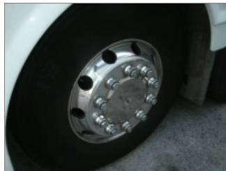
RIGHT REAR TIRE