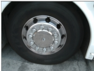
LEFT REAR TIRE