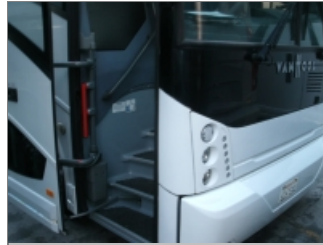
RIGHT SIDE FRONT