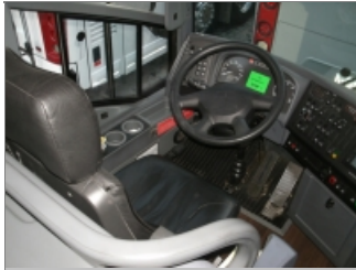
DASH W/ STEERING WHEEL