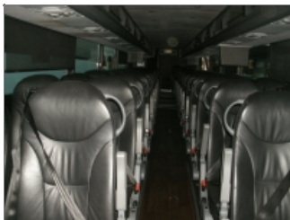
INTERIOR FRONT TO REAR