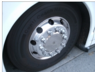
LEFT STEER TIRE