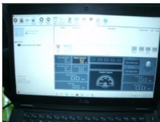
J PRO SCREEN