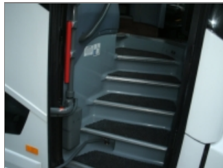
ENTRY DOOR AREA