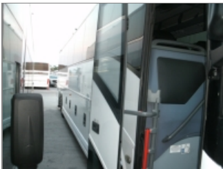
RIGHT SIDE FRONT