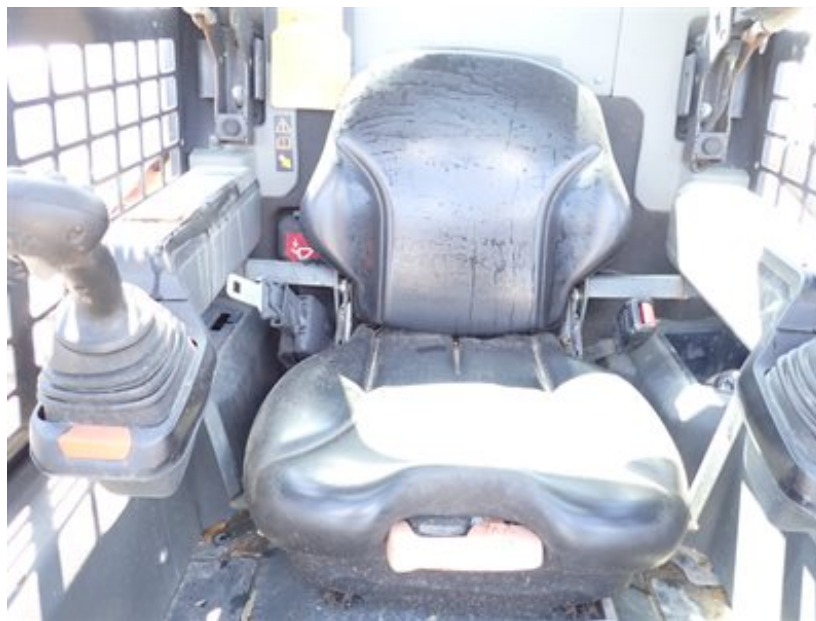
Seating / Interior