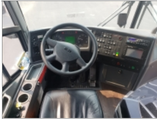
DASH W/ STEERING WHEEL