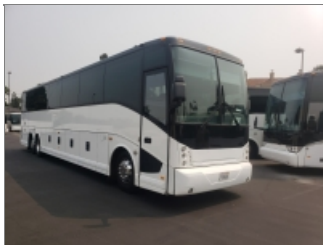
FRONT RIGHT CORNER