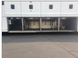
INSIDE STORAGE COMPARTMENTS