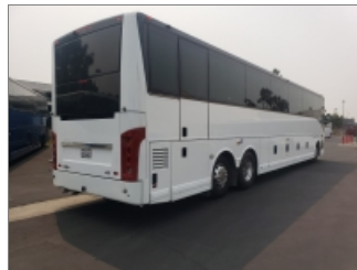
REAR RIGHT CORNER