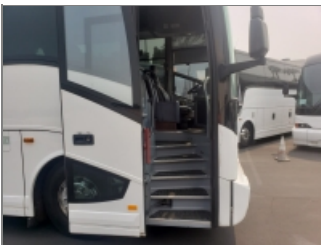
ENTRY WAY STEPS AT FRONT DOOR