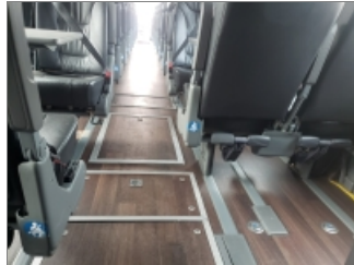
FLOOR OF BUS, BACK TO FRONT