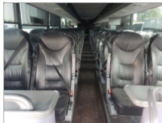
INSIDE OF BUS, FRONT TO BACK