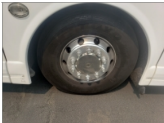
LEFT STEER TIRE