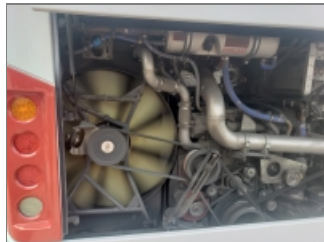
ENGINE COMPARTMENT LEFT SIDE