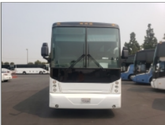
FRONT OF BUS