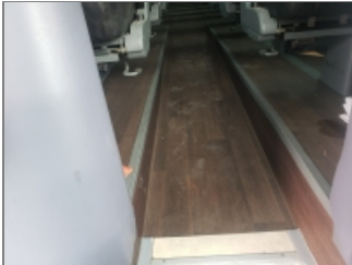
FLOOR OF BUS, FRONT TO BACK