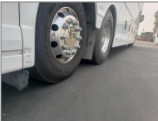
RIGHT REAR TIRES