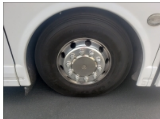
RIGHT STEER TIRE