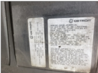
ENGINE FAMILY NUMBER