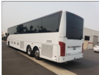
REAR LEFT CORNER