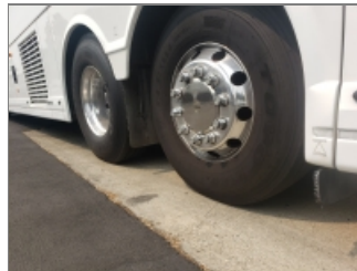
LEFT REAR TIRES