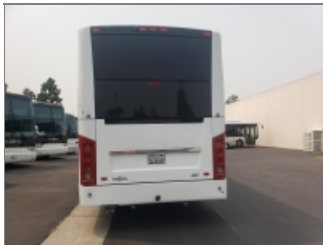
REAR OF BUS