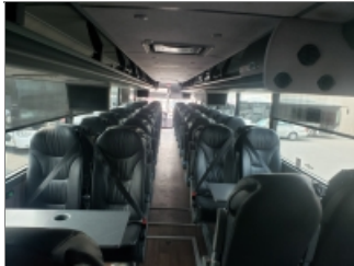
INSIDE OF BUS, BACK TO FRONT