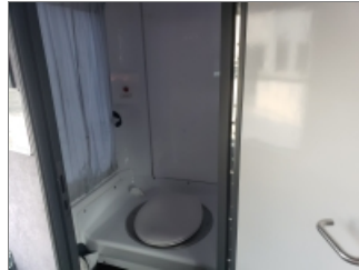
INSIDE RESTROOM #1