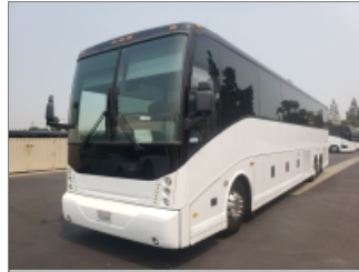
FRONT LEFT CORNER