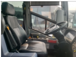
COMPLETE DRIVERS SEAT