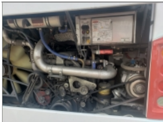
ENGINE COMPARTMENT RIGHT SIDE