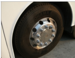
RIGHT REAR TIRE