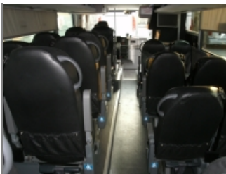
INTERIOR REAR TO FRONT