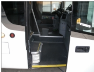
ENTRY DOOR AREA