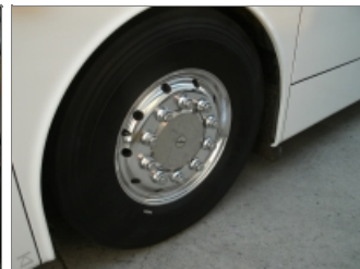
LEFT STEER TIRE