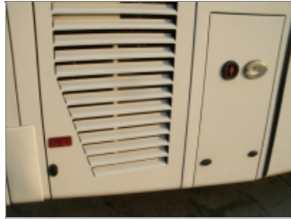
ENGINE VENT DOOR