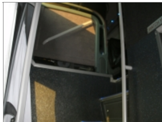
STAIRS TO UPPER SEATS