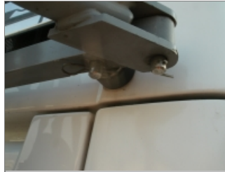
BIKE RACK PIN