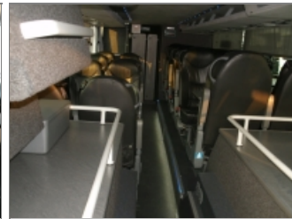
INTERIOR FRONT TO REAR