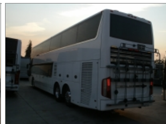
LEFT SIDE REAR