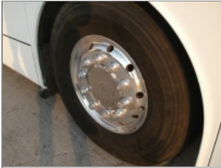
RIGHT FRONT STEER TIRE