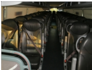
UPPER INTERIOR FRONT TO REAR