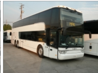
RIGHT SIDE FRONT