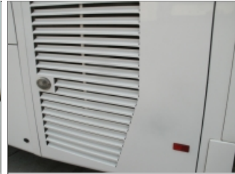
ENGINE VENT DOOR