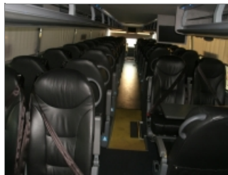
UPPER INTERIOR REAR TO FRONT