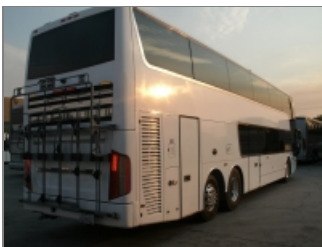
RIGHT SIDE REAR