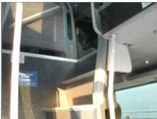
STAIRS TO UPPER SEATS