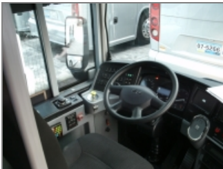
DASH W/ STEERING WHEEL