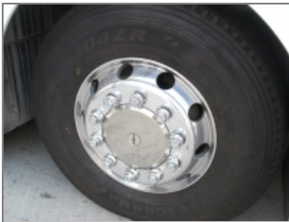
LEFT REAR TIRE