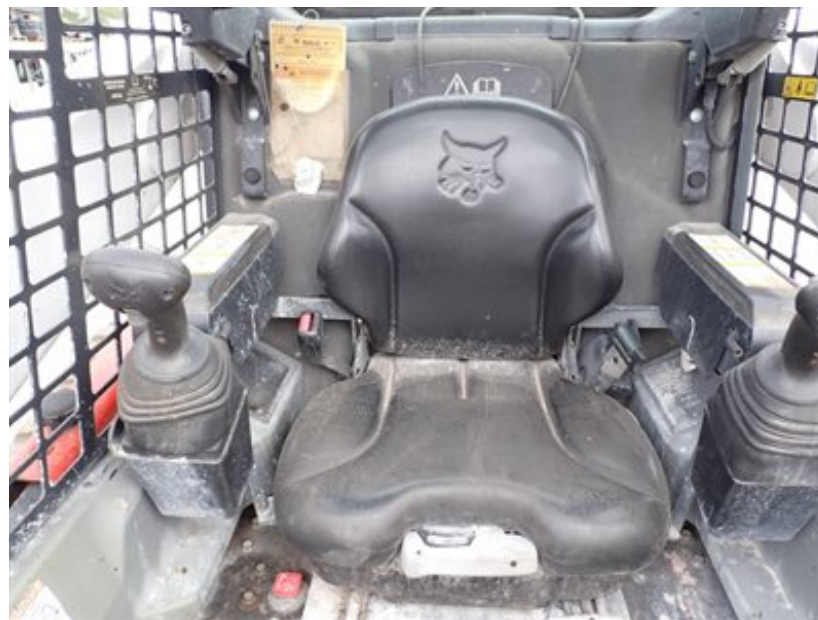
Seating / Interior