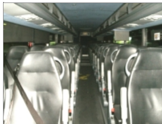
INTERIOR FRONT TO REAR