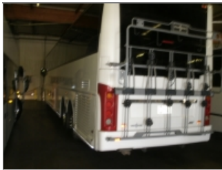
LEFT SIDE REAR