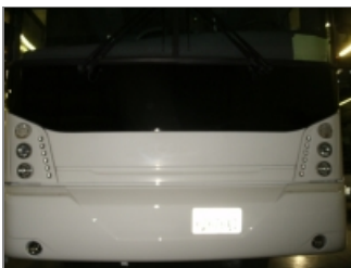
FRONT CENTER LOWER