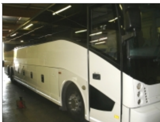
RIGHT SIDE FRONT