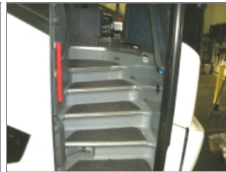
ENTRY DOOR AREA