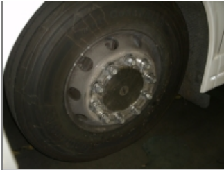
LEFT STEER TIRE