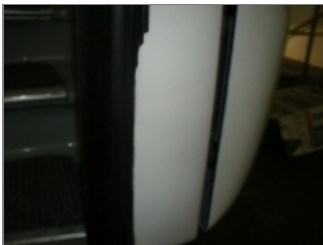
ENTRY DOOR WEATHERSTRIP