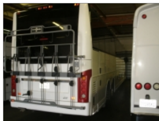
RIGHT SIDE REAR