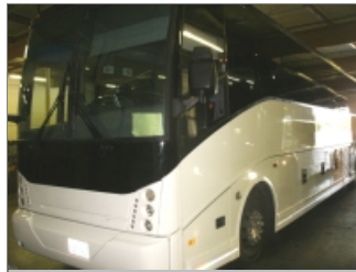
LEFT SIDE FRONT