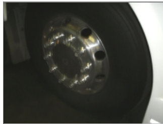
LEFT REAR TIRE