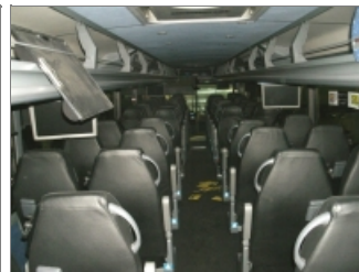
INTERIOR REAR TO FRONT