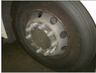
RIGHT FRONT STEER TIRE