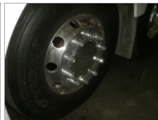
RIGHT REAR TIRE