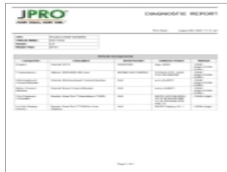
J PRO 1