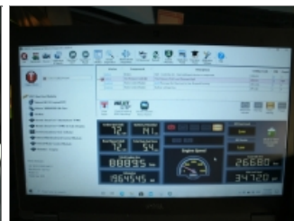
J PRO SCREEN