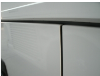
RIGHT SIDE DAMAGE 1