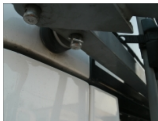
BIKE RACK PIN