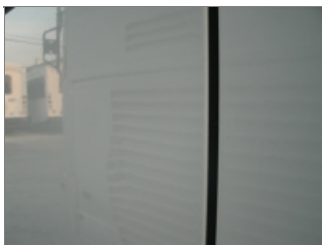
RIGHT SIDE DAMAGE 2