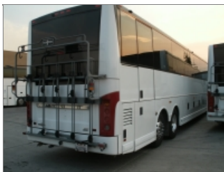
RIGHT SIDE REAR