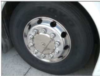
LEFT REAR TIRE