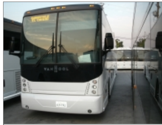
LEFT SIDE FRONT