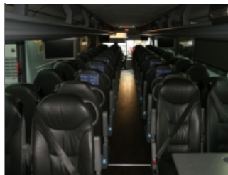
INTERIOR REAR TO FRONT