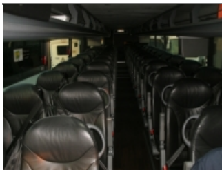
INTERIOR FRONT TO REAR