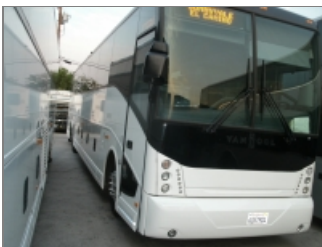
RIGHT SIDE FRONT