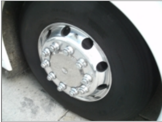
RIGHT FRONT STEER TIRE