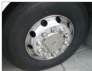
RIGHT REAR TIRE