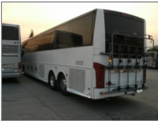
LEFT SIDE REAR