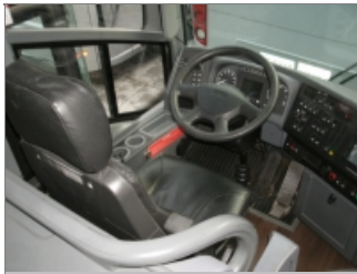
DASH W/ STEERING WHEEL