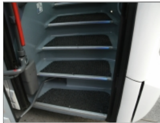
ENTRY DOOR AREA