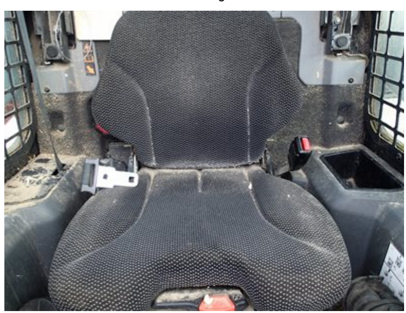
Seating / Interior