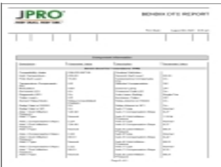
J PRO 4