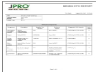
J PRO 6