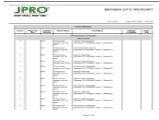
J PRO 2