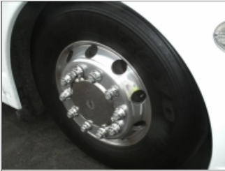
RIGHT FRONT STEER TIRE