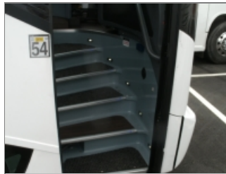
ENTRY DOOR AREA