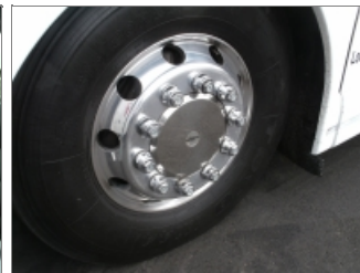
LEFT STEER TIRE