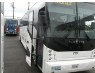
RIGHT SIDE FRONT