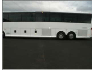
LEFT SIDE BUS