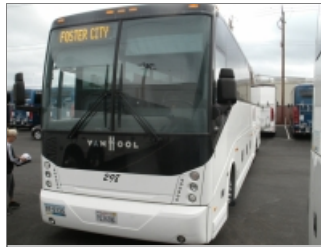
LEFT SIDE FRONT