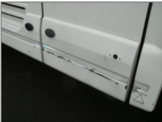
LEFT SIDE DAMAGE 2