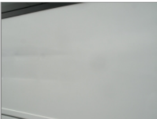
RIGHT SIDE PANEL DAMAGE 1