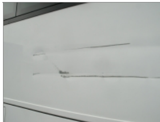
RIGHT SIDE PANEL DAMAGE 2