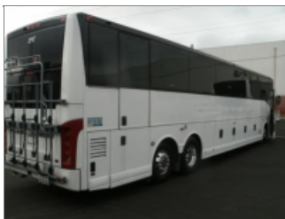
RIGHT SIDE REAR