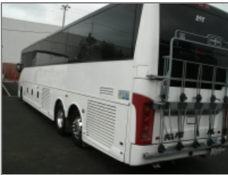
LEFT SIDE REAR