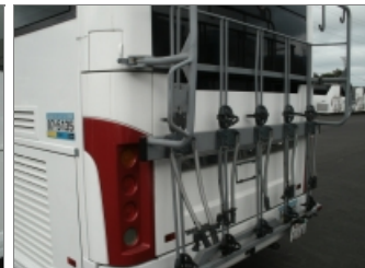
LEFT SIDE ENGINE DOOR DAMAGE