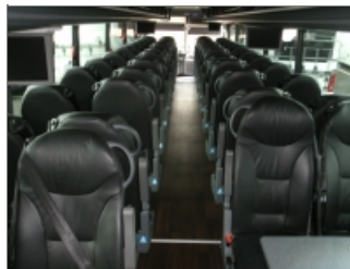
INTERIOR REAR TO FRONT