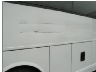
RIGHT SIDE PANEL DAMAGE 3