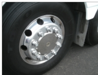
RIGHT REAR TIRE