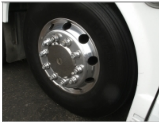
LEFT REAR TIRE