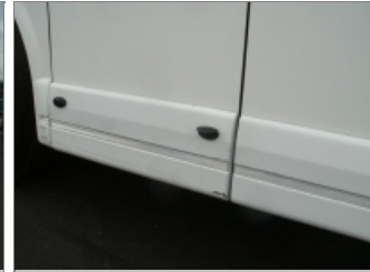
RIGHT SIDE DAMAGE 2