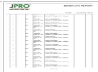
J PRO 3