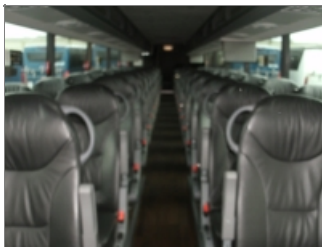
INTERIOR FRONT TO REAR