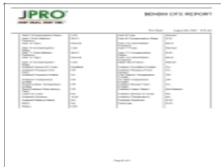
J Pro 5