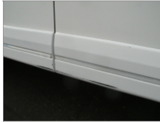
RIGHT SIDE DAMAGE 1